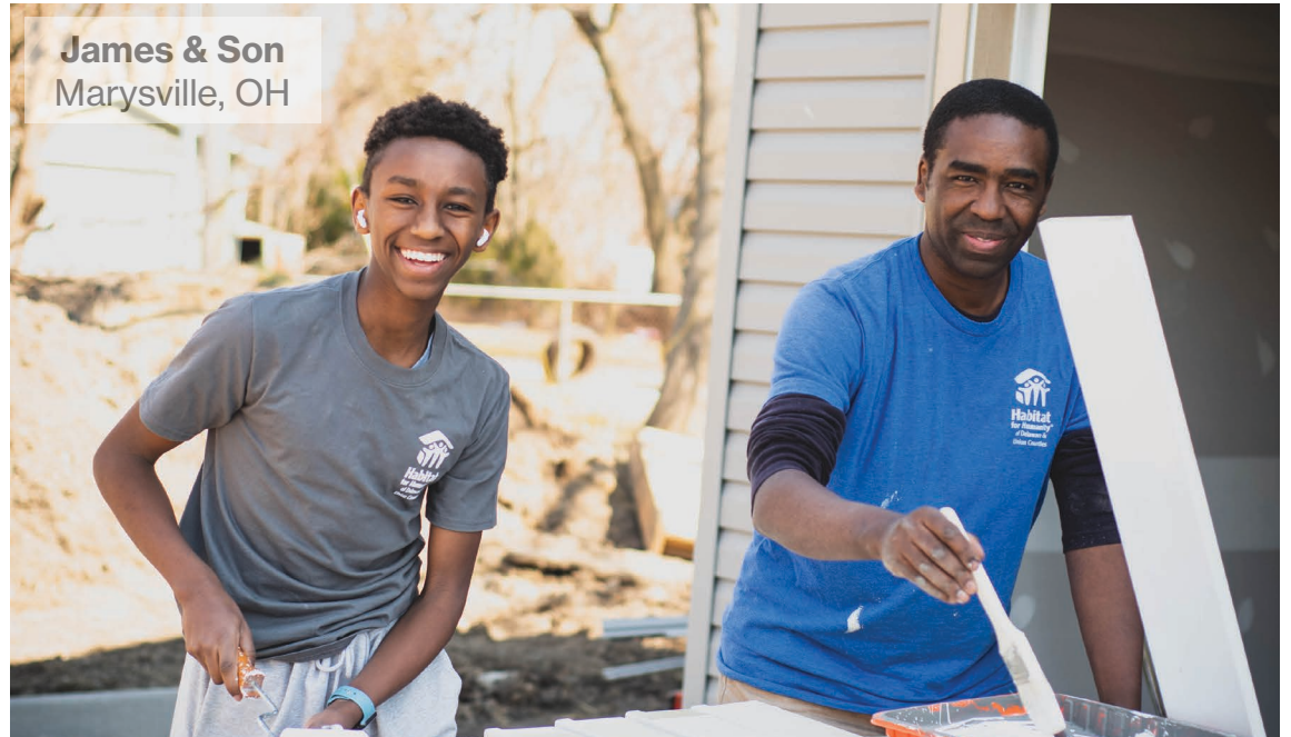
James & Son Marysville, OH